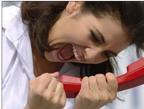
Each year, the Federal Communications Commission receives more than 200,000 complaints about unwanted calls.

numbers. Scammers may spoof their caller ID to display a fake number that appears to be local. If you answer such a call, hang up immediately.